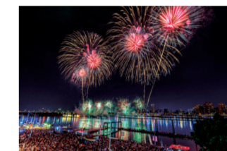
Taipei Summer Festival

Taipei Marathon, Taipei Xmas, Gongguan Christmas, Taipei New Year's Party, Taipei Lunar New Year Festival and Taipei Lantern Festival all ignite the city's passion and warm vitality as well as infuse the year's ending with great colors.