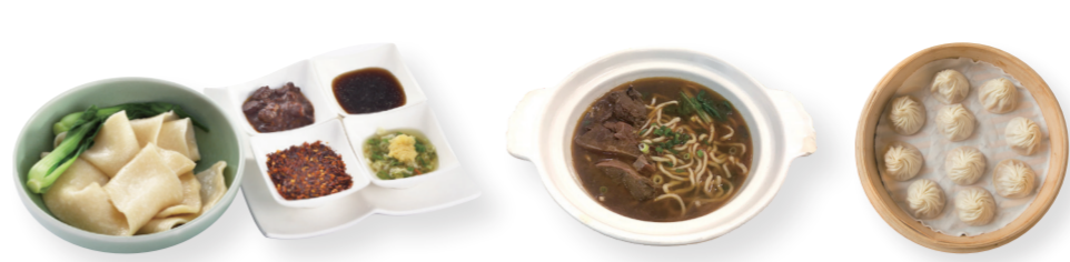
Hand Made Noodles with Chili Sauce The Guest House (請客樓)