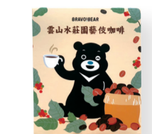
Drip Bag Coffee

Discover the popular Bravo the Bear, Taipei City's beloved mascot, and its diverse merchandise. Visit the Bravo office on the first floor of Taipei City Hall to purchase practical items such as plush toys, drip bag coffee, phone lanyard sets, phone cases, and ID card holders.