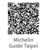
Michelin Guide Taipei