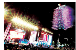
Taipei New Year's Party