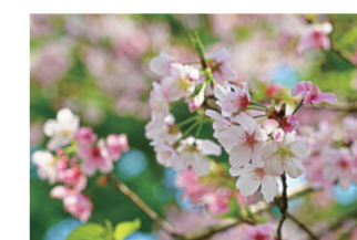
Yangmingshan Flower Festival

In summer, there are numerous exciting events staged in riverside parks. Taipei International Dragon Boat Championships, Taipei Water Festival, and Taipei Summer Festival at Dadaocheng are all events where the whole family can cool down in hot summer!