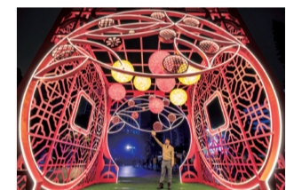
Taipei Lantern Festival